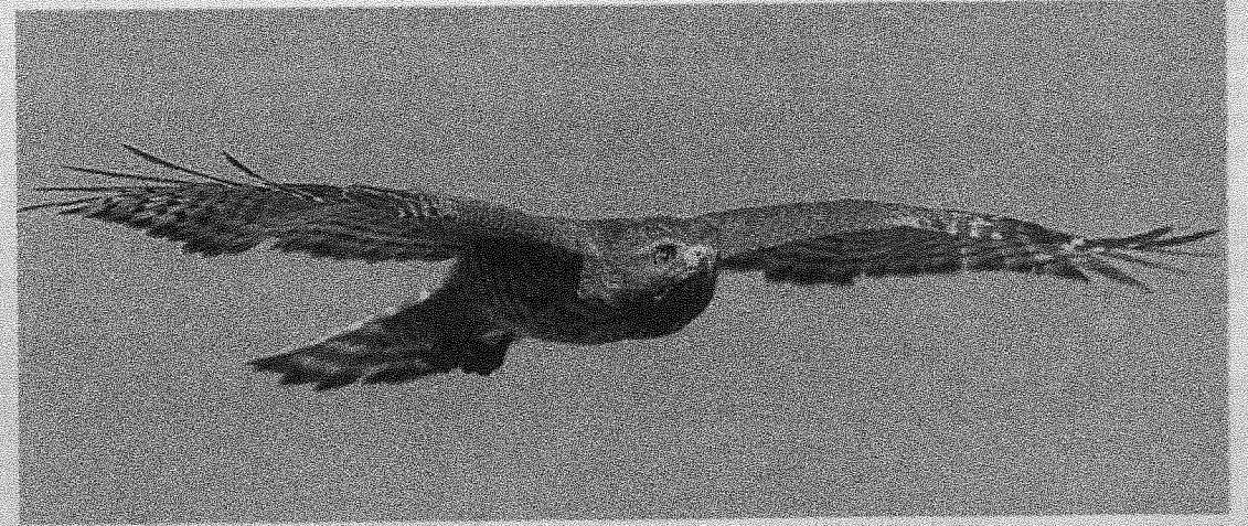
The Laguna's 230 species of birds include this soaring hawk.