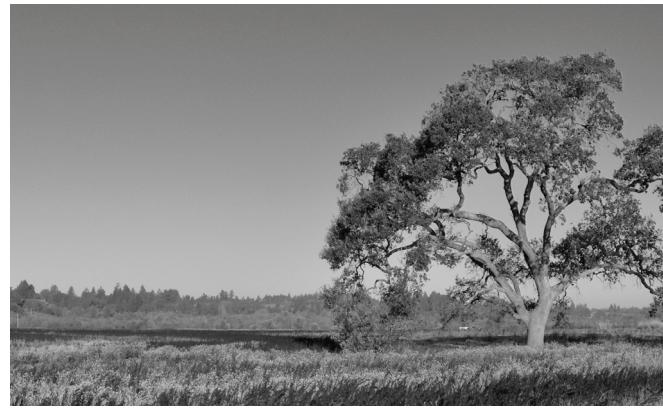
Laguna Wildlife Area in September.