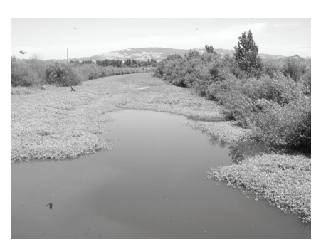
Before: Looking east from Stony Point Road Bridge, July 2005.

We began in mid-July after receiving our permit from the Regional Water Quality Control Board. Under our supervision, the work was carried out by Clean Lakes, Inc., a company with over 30 years experience in aquatic weed control. High variability among the treatment sites required use of many different types of equipment, such as an airboat, a swamp cat, trucks, excavators and backpack sprayers. The channels were suited to airboats after opening a pathway for travel. We first cut a path down the middle of the channel using a floating tugboat-like machine equipped with fan-like blades that chop the plant.