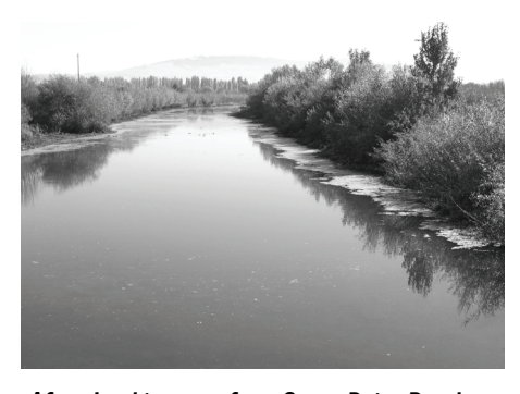
After: Looking east from Stony Point Road Bridge, Oct. 2005.

The marsh presented a different challenge. These areas have recently become inundated year-round, creating ideal habitat for Ludwigia . The water is shallow and the plant density is immense, so airboats cannot be used in these areas. Our partners at the Marin Sonoma Mosquito Vector Control recommended using a swamp cat, a machine similar to snow cats common in ski areas but equipped to travel in up to 2 ½ feet of water.