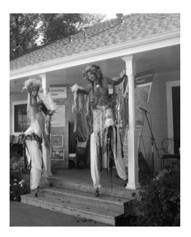
Mystic Family Circus performing on stilts at the Art and Garden Gala.