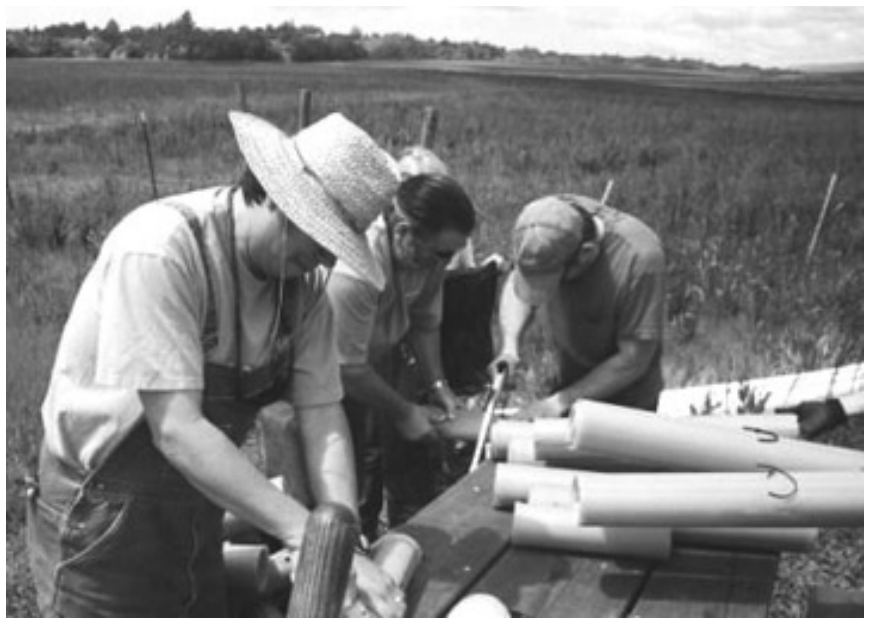
Agilent Technologies employees cutting tree shelters down to size for oak saplings.

Major funding and in-kind donations for the Middle Reach project have been